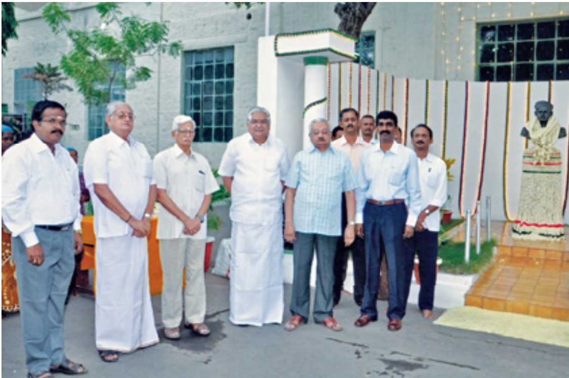
Our Directors and Executives participating on the eve of our Founder's 102 nd Birth day ceremony.