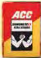
Concrete+ Xtra Strong