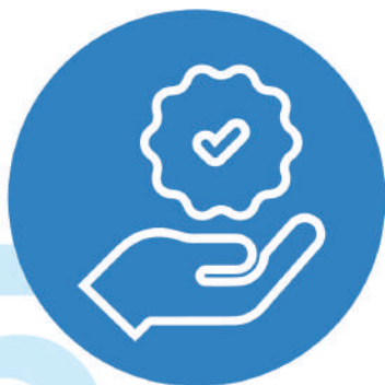
5 Brand Partnerships