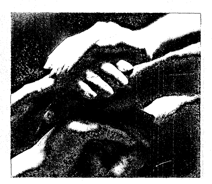
The World of Fascinating Hindware