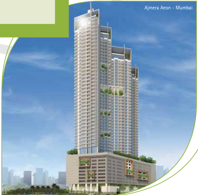
Ajmera Aeon - Mumbai

One such ongoing project in Mumbai is the first residential tower in the heart of Ajmera's i-Land, Ajmera Aeon. This 49-storey tower promises to take the definition of lifestyle and sustainable living to a whole new level and is destined to get the Green Building Certification. Ajmera Aeon is planned by Singapore-based architects Space Matrix and offers the latest in technology, clean renewable energy along with a life of indulgence and new age opulence.