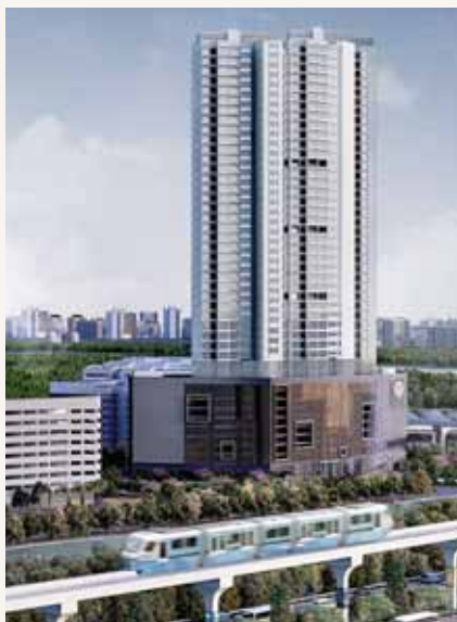
Ajmera Aeon, Wadala