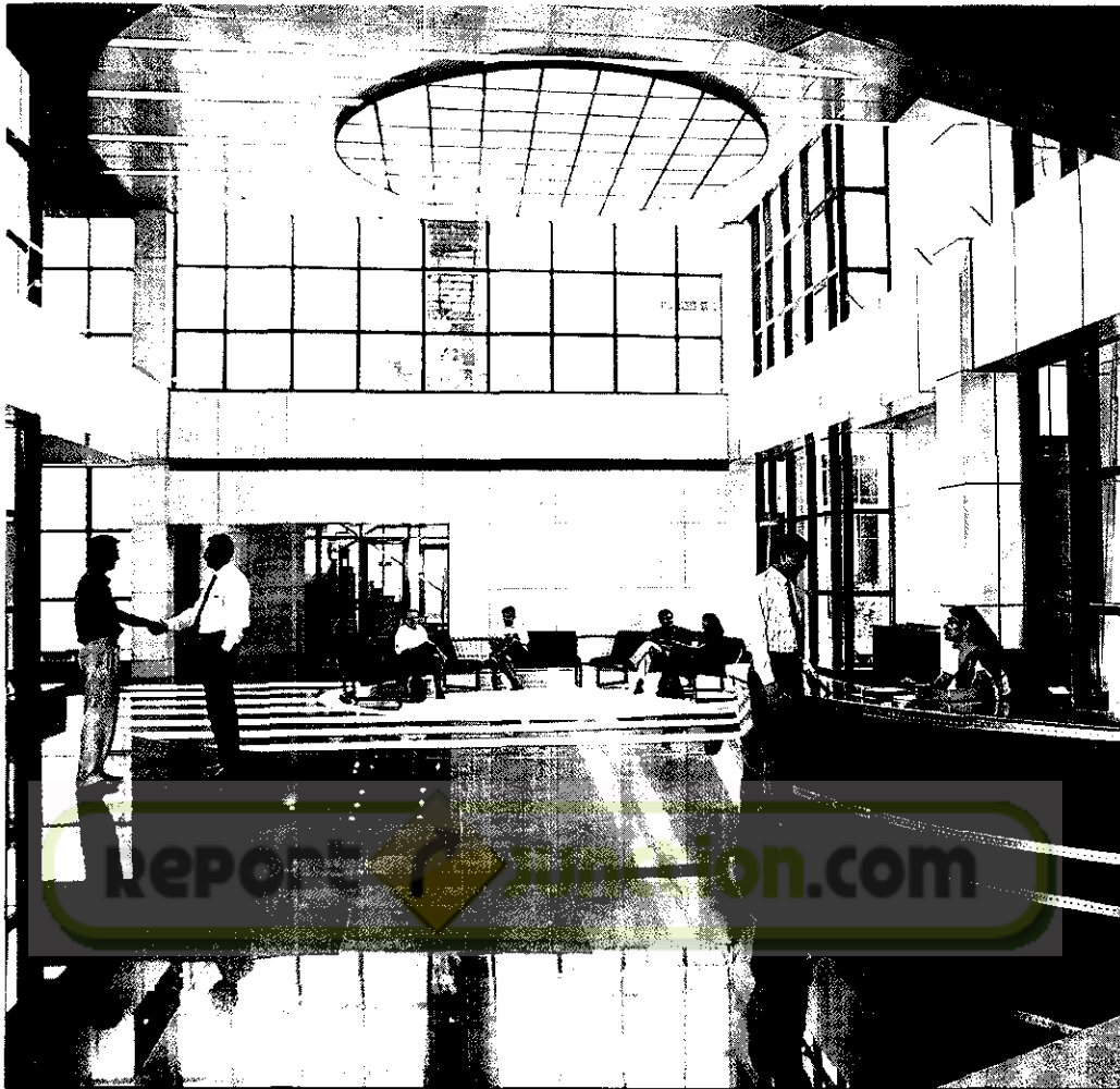
Corporate Office at Gurgaon, Haryana.