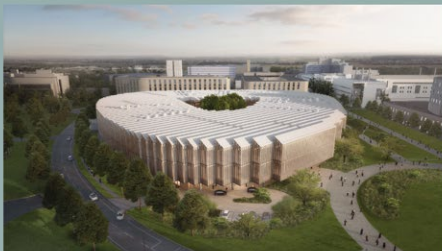
> Cambridge, UK