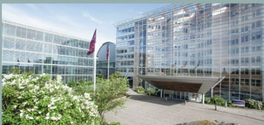
> Gothenburg, Sweden

Globally we are increasing our proximity to bioscience clusters and co-locating around three strategic R&D centres.