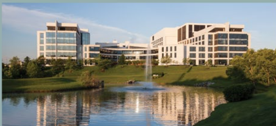
> Gaithersburg, Maryland US