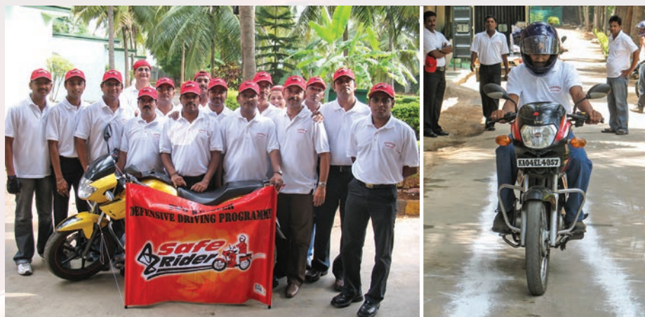
Safe rider workshop in Bengaluru

During the year, new initiatives were introduced on building a safe working environment for our women employees and many health awareness activities were undertaken.