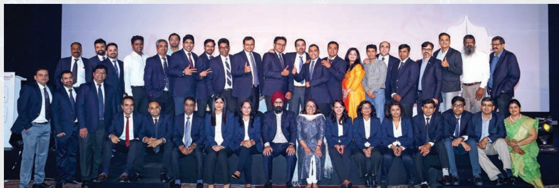
Tagrisso launch team