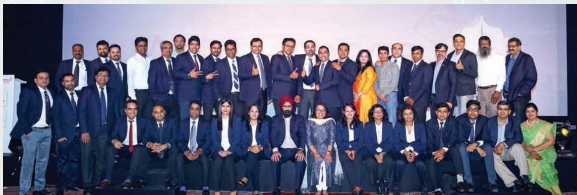
Tagrisso launch team