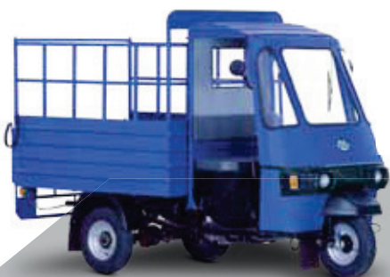
Front Engine High Deck 500 kg Payload Capacity