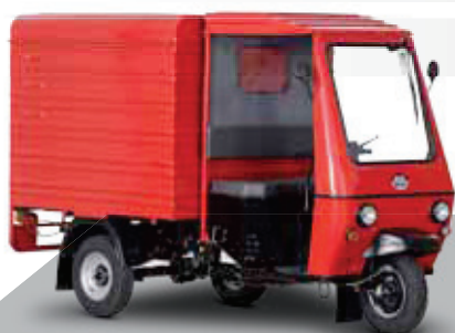
Front Engine Delivery Van 500 kg Payload Capacity