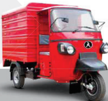
Front Engine Delivery Van 500 kg Payload Capacity