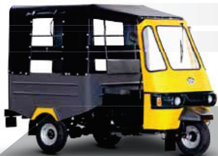
Front Engine Passenger 6+1 500 kg Payload Capacity