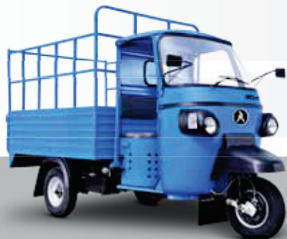
Front Engine High Deck 500 kg Payload Capacity