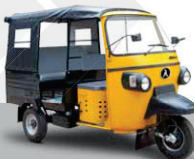
Front Engine Passenger 3+1 500 kg Payload Capacity