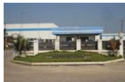
Unit 2 - Chakan, Pune, Maharashtra (Area - 58,364 sqm)