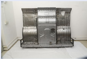
Assembly Sub Structure with Floor