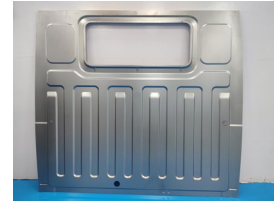
Panel Cab Rear