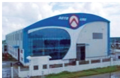
Unit 3 - Pant Nagar, Uttarakhand (3 Units) (Area - 20,400 sqm)