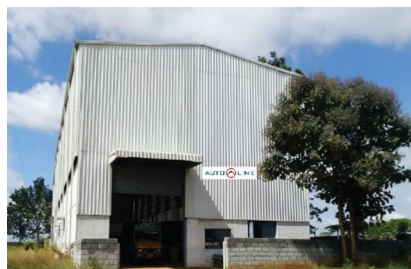
Unit 5 - Hosur, Tamil Nadu (Area - 3,200 sqm)