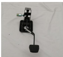
Foot Control Modules