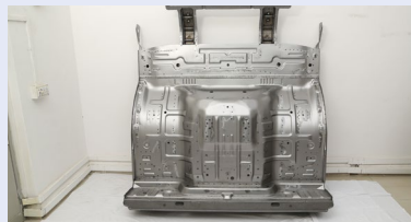
Assembly Under Body Complete