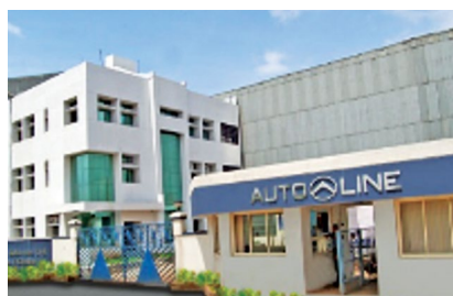
Unit 1 - Chakan, Pune, Maharashtra (Area - 11,400 sqm)