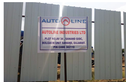
Unit 6 - Sanand, Gujarat (Area - 20,000 sqm)