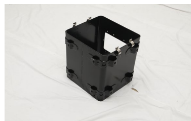
Large Stamp Assemblies for Export