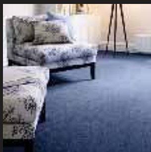
Residential Wall to Wall Carpets