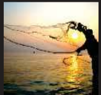
Ropes & Nets