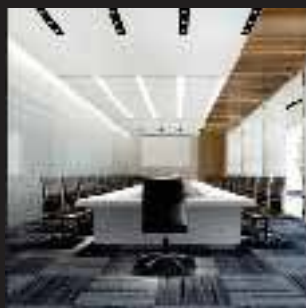
Contract / Hospitality Carpets