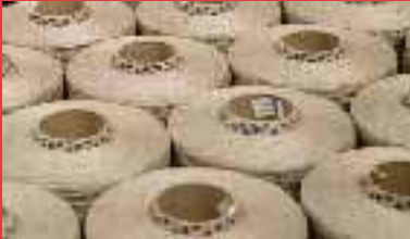
Bulk Continuous Filament Yarn (BCF)

A well-diversified product portfolio & customer base across different geographies.