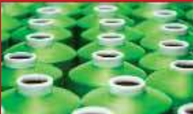
Packaged Dyed Yarn (PDY)