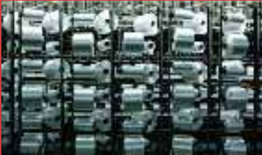
Industrial Dyed Yarn (IDY)