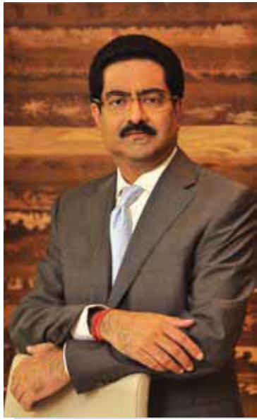
Mr. Kumar Mangalam Birla Non-Executive Chairman