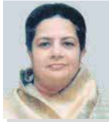
Mrs. Rajashree Birla Non-Executive Director