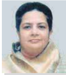
Mrs. Rajashree Birla Non-Executive Director