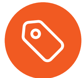
BRAND & RETAIL

Apparel, Home Textiles, Industrial Segment & Non-Woven