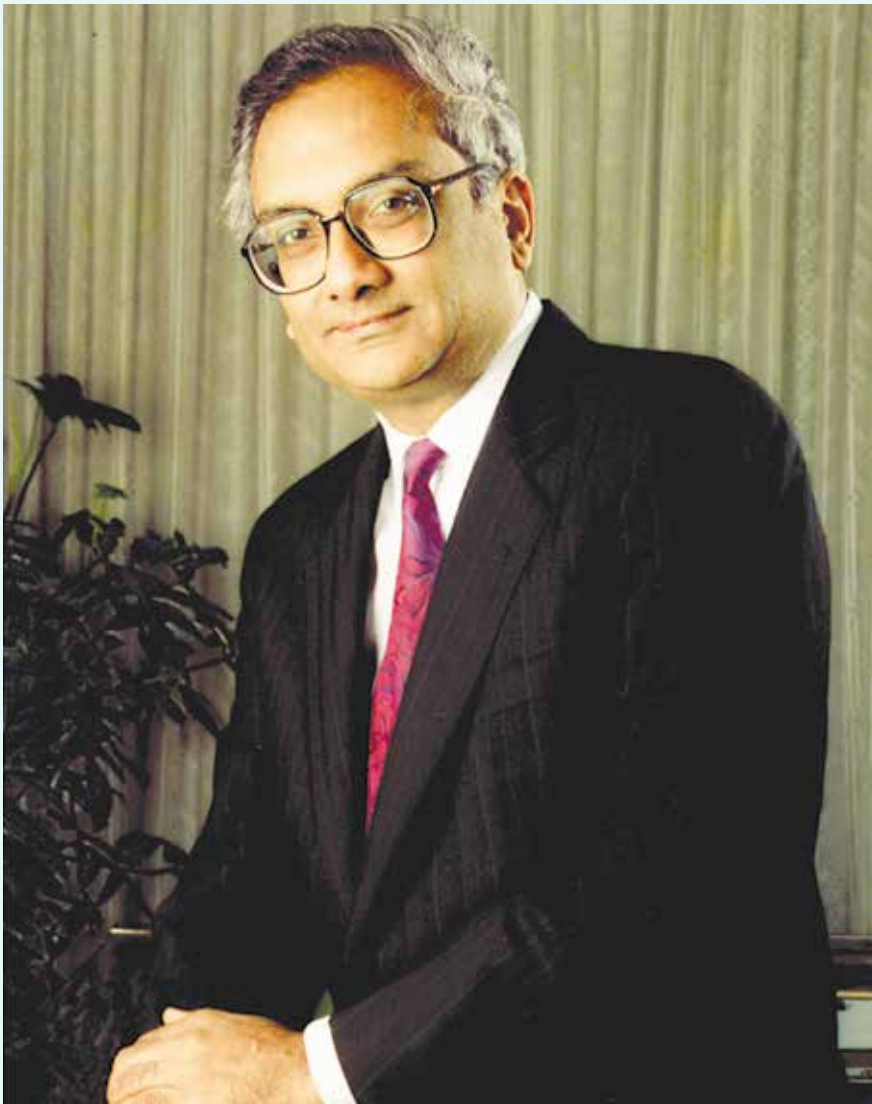
Mr. Aditya Vikram Birla