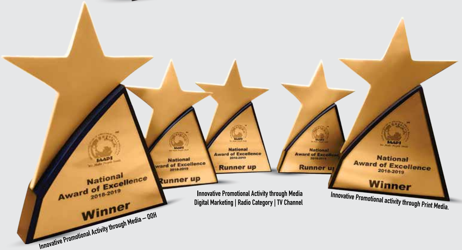
Innovative Promotional Activity through Media – OOH