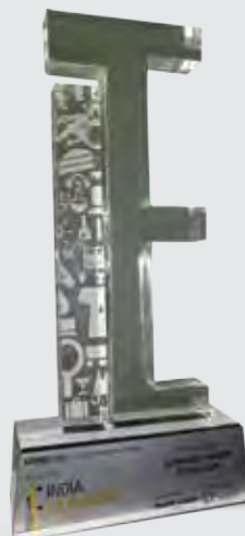
INDIA LICENSING AWARDS 2018 (LIMA 2018) Licensee of the Year – Theme & Amusement Park