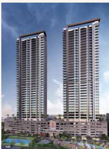
Ajmera Treon, Wadala