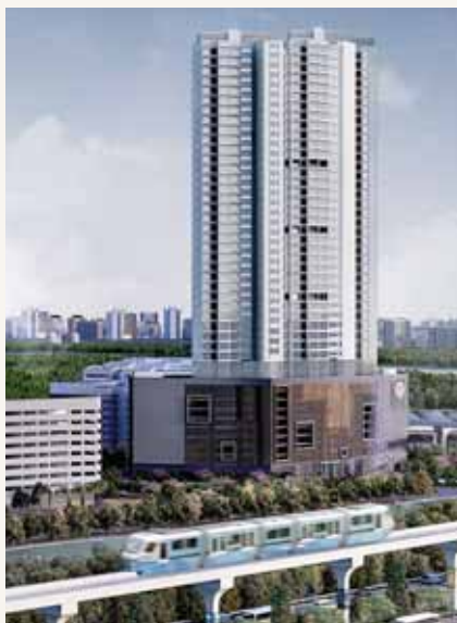
Ajmera Aeon, Wadala