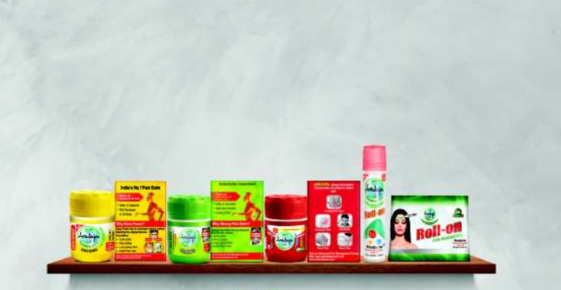
Pain Range Extra Power Pain Balm, Strong Pain Balm, Head Roll-On and New Maha Strong