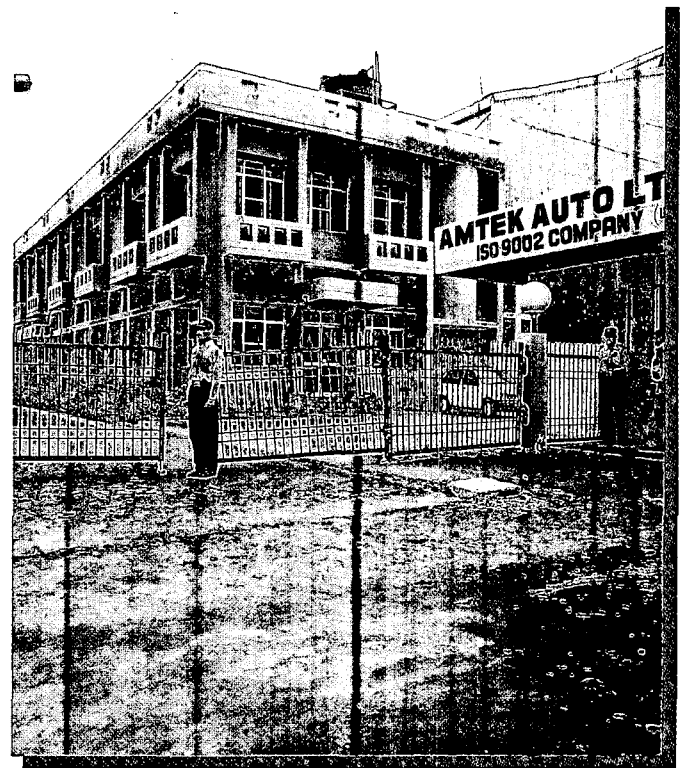
AMTEK AUTO LIMITED (UNIT II)