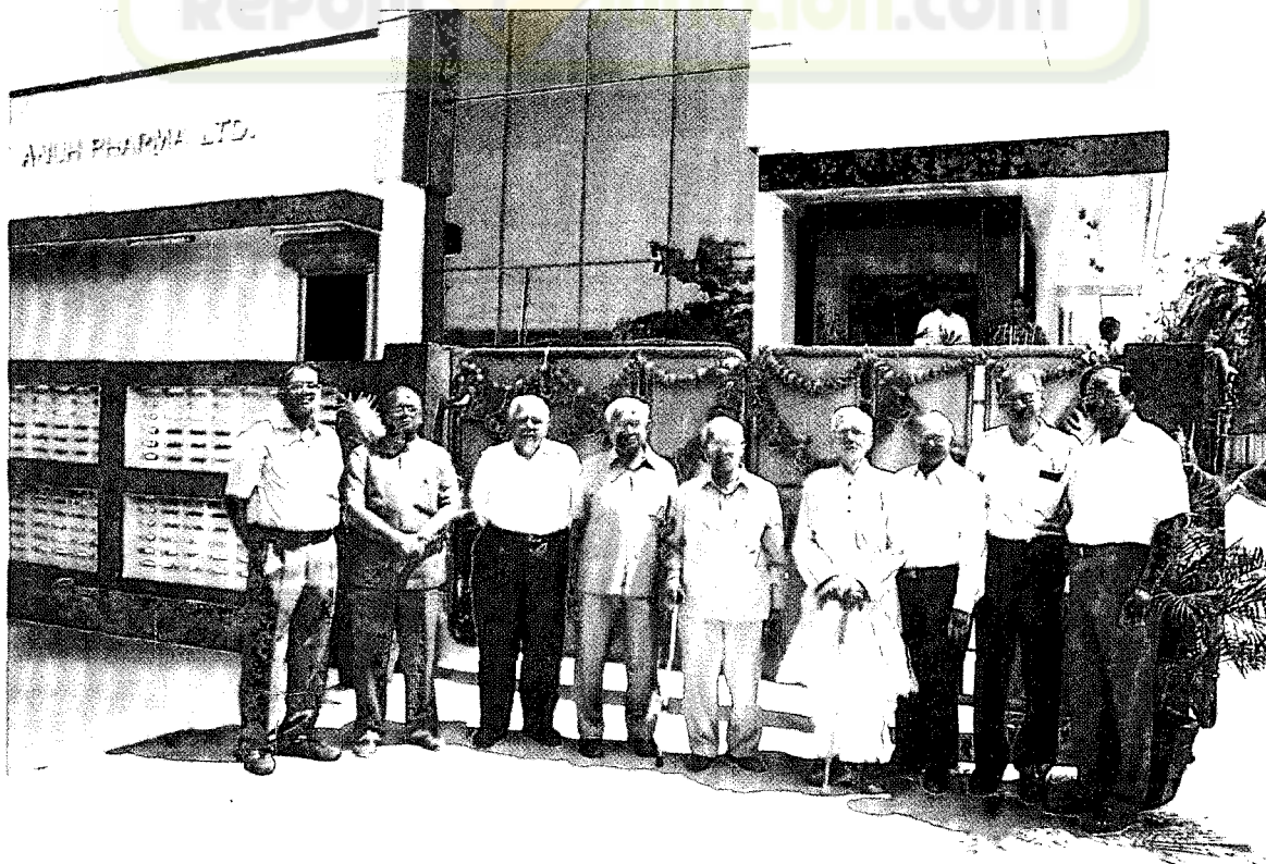
Directors of the company and other distinguished guests at the inaugural function of the Company's new API facility at Tarapur.