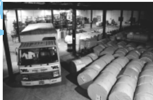
Thanks to the logistics backbone of Vijayanand Roadlines, Vijay Karnataka can keep its early morning tryst with its readers

Product and distribution taken care of, Vijay Karnataka, clearly gunning for leadership position, dropped price to Rs 1.50 for a copy