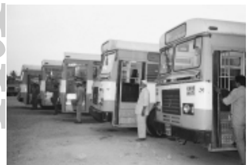
At daybreak, the buses are ready to roll out