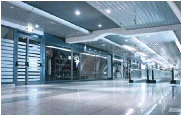
Glazed Vitrified Tiles