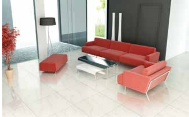
Polished & Double Charge Vitrified Tiles