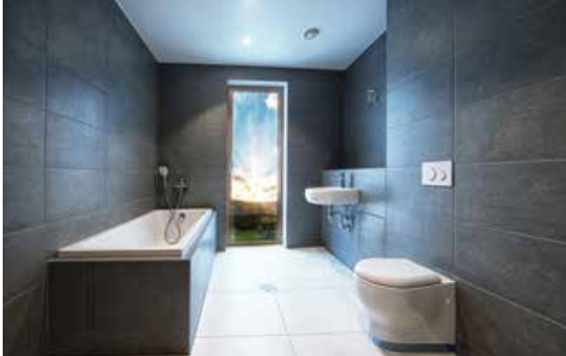
Ceramic Wall & Floor Tiles