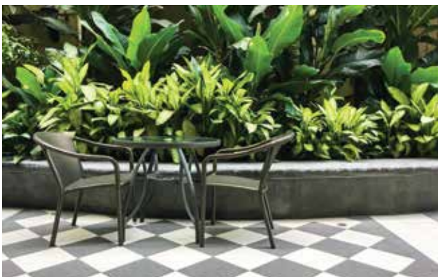
Outdoor Vitrified Tiles