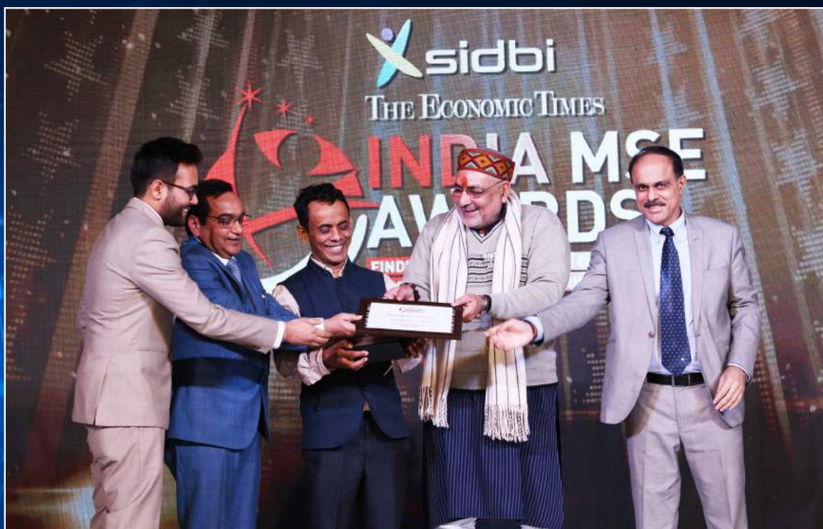
"Awarded as the Small Enterprise of the Year - Services" at SIDBI-ET India MSE Awards ,2018.