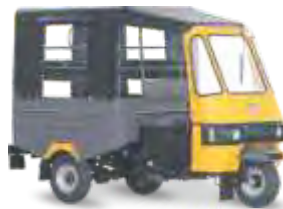
FRONT ENGINE PASSENGER 6+1