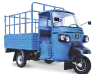
FRONT ENGINE HIGH DECK 500 KG PAYLOAD CAPACITY