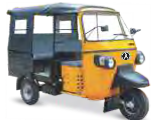
FRONT ENGINE PASSENGER 3+1