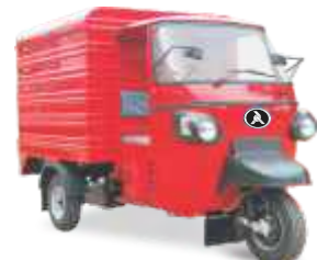
FRONT ENGINE DELIVERY VAN 500 KG PAYLOAD CAPACITY