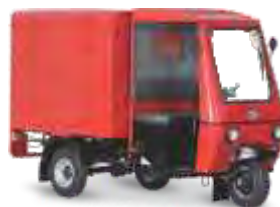
FRONT ENGINE DELIVERY VAN 500 KG PAYLOAD CAPACITY