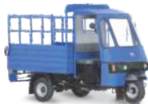
FRONT ENGINE HIGH DECK 500 KG PAYLOAD CAPACITY