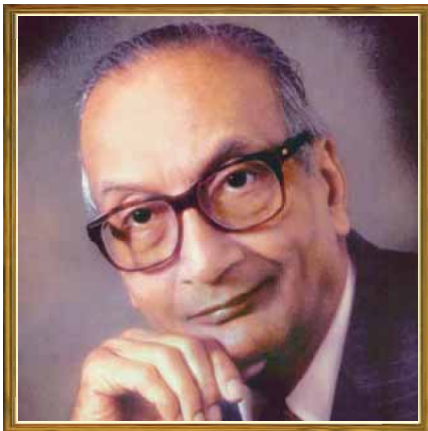
Dr. Krishna Kumar Birla

The late Dr. Krishna Kumar Birla was son of the legendary Indian industrialist Shri. Ghanshyam Das Birla. He was born on 12th October, 1918 at Pilani in Rajasthan and over time established himself as a captain of Indian industry. He founded one of India's well-known business conglomerates and was a man of many facets - patriot, industrialist and philanthropist.