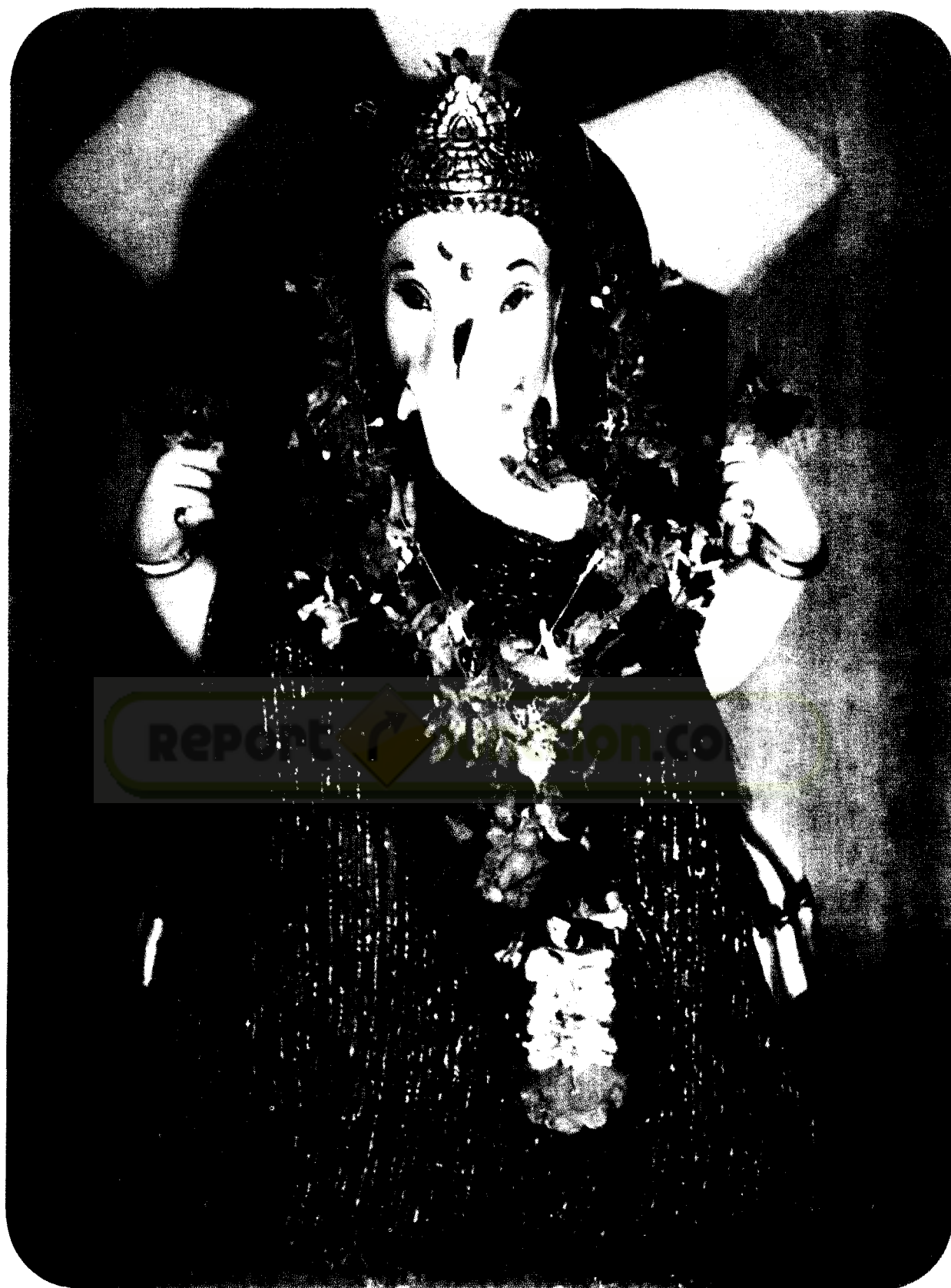
LORD GANESH TEMPLE AT AMBIVLI FACTORY