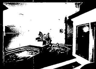
The Ascot Soul Club