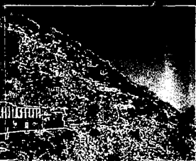
The Mini Train