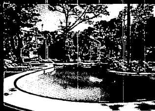
The Ascot Pool