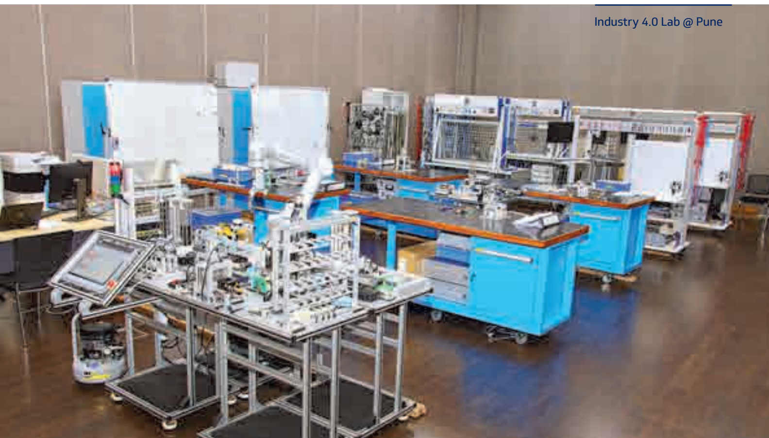
Industry 4.0 Lab @ Pune