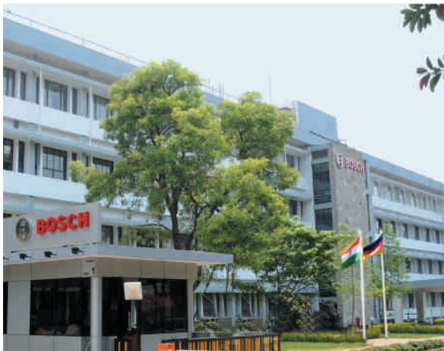
Bosch Limited Corporate Office in Bangalore, India.

Bosch has been present in India for more than 80 years - first through a representative office in Calcutta since 1922, and from 1951 through its subsidiary Bosch Limited.