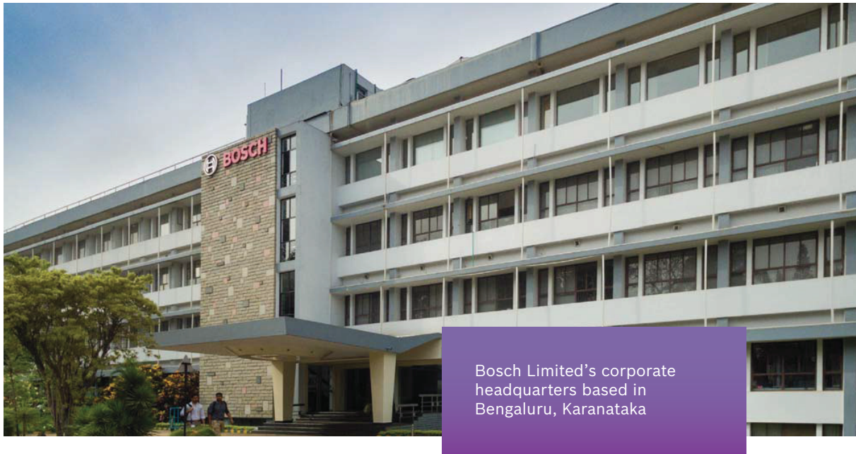
Bosch Limited's corporate headquarters based in Bengaluru, Karnataka

Bosch has been present in India for more than 90 years - first through a representative office in Kolkata ( then Calcutta ) since 1922, and from 1951 through its subsidiary Bosch Limited ( then Motor Industries Company Limited ).