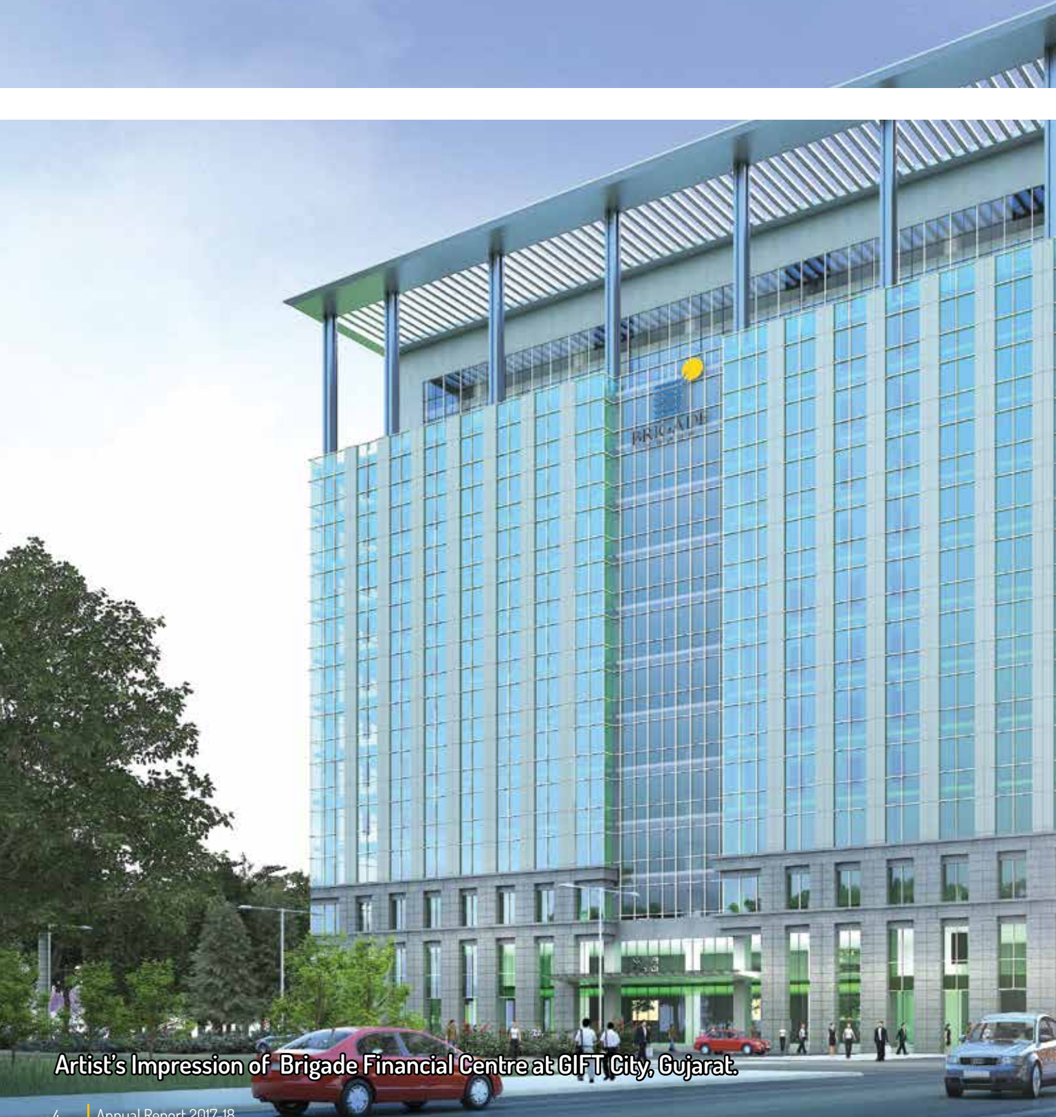
Artist's Impression of Brigade Financial Centre at GIFT City, Gujarat.