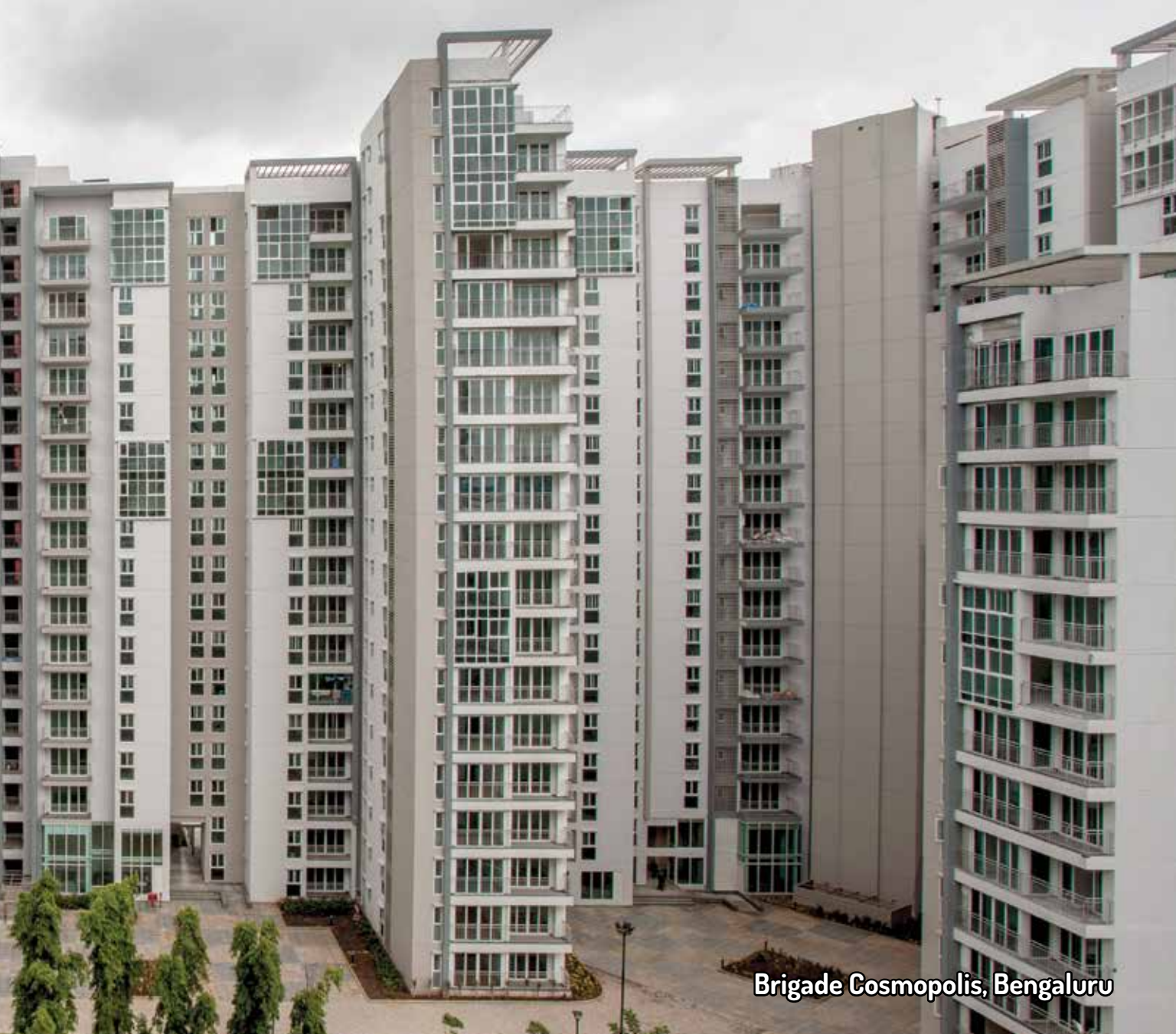
Brigade Cosmopolis, Bengaluru