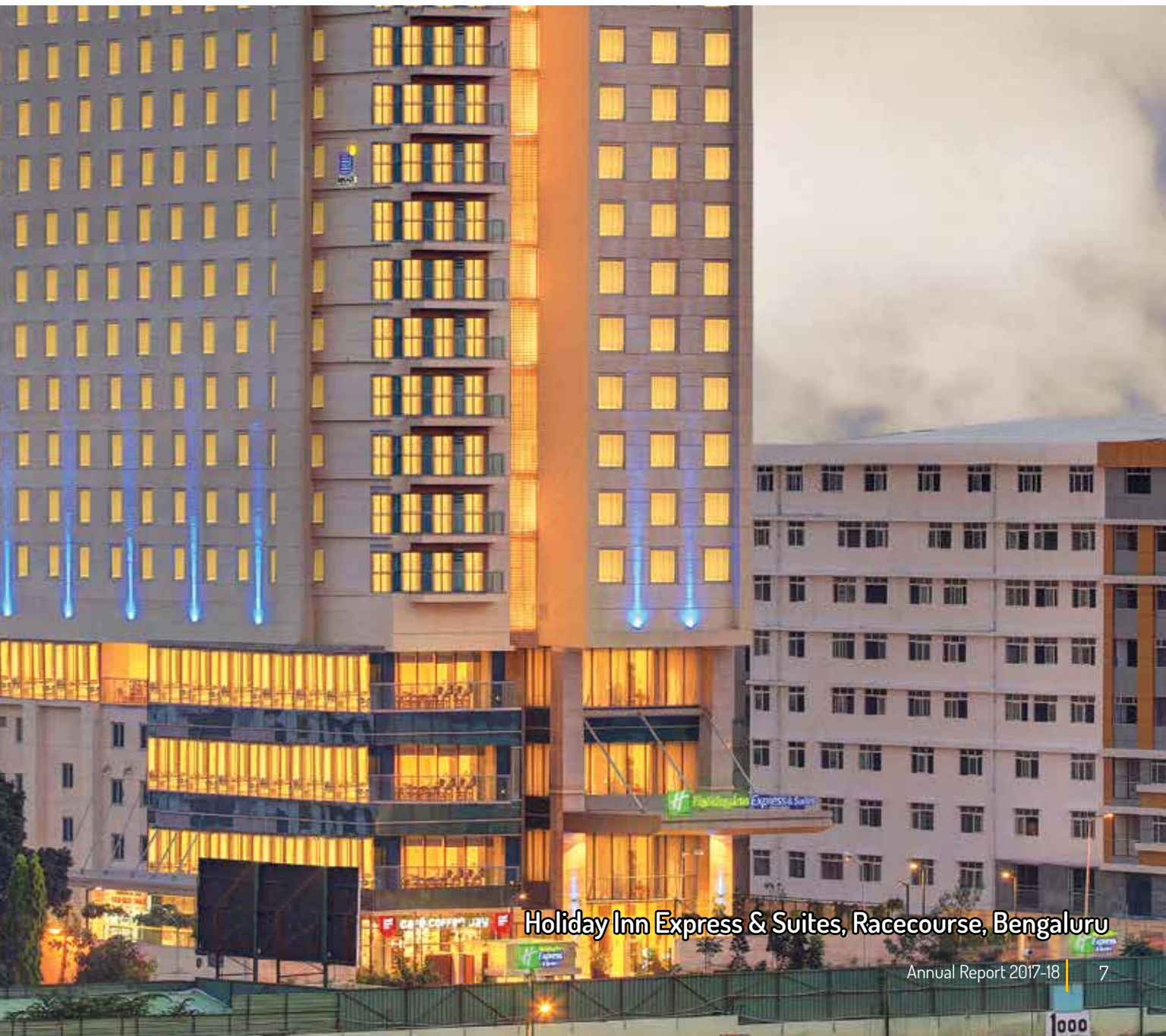
Holiday Inn Express & Suites, Racecourse, Bengaluru