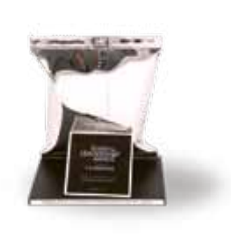
Forbes Leadership Awards Best CEO-Private Sector