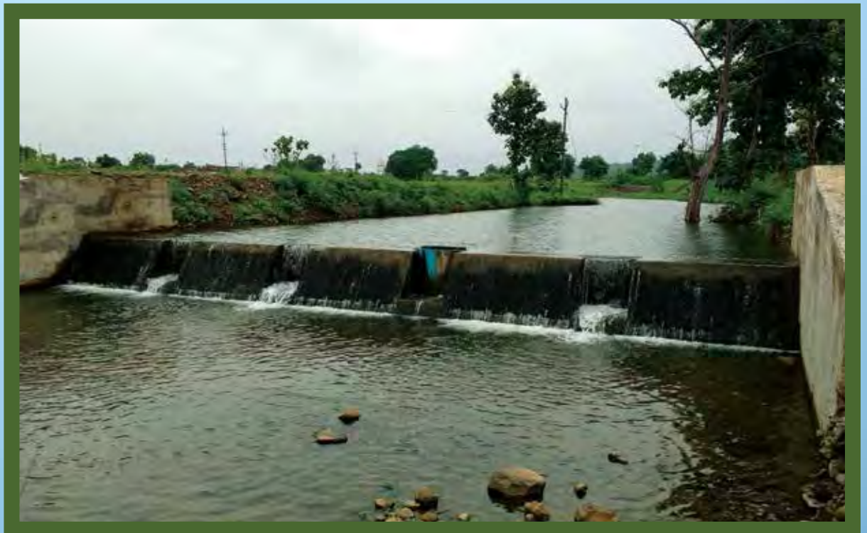
Construction of Check Dams