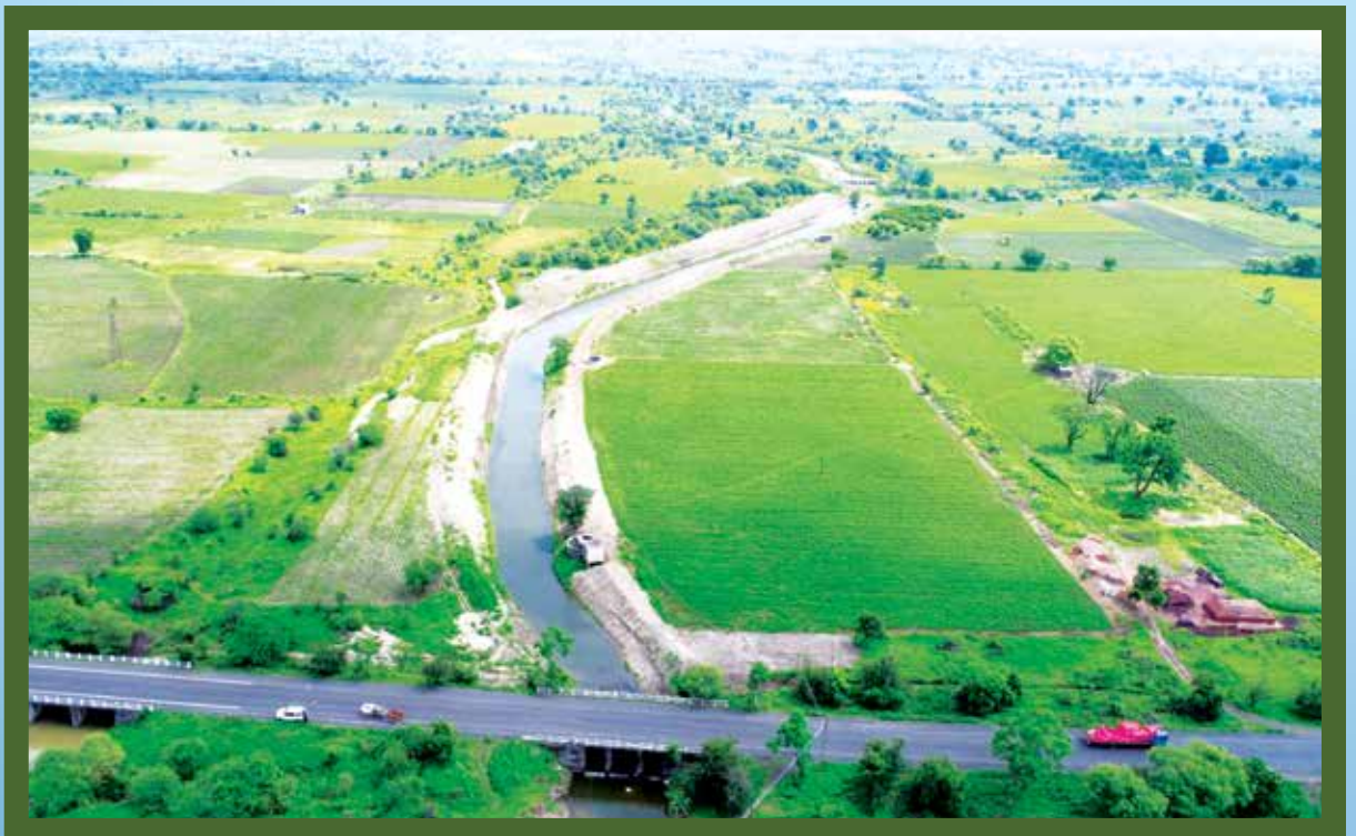
Rejuvenation of Rivers and Streams