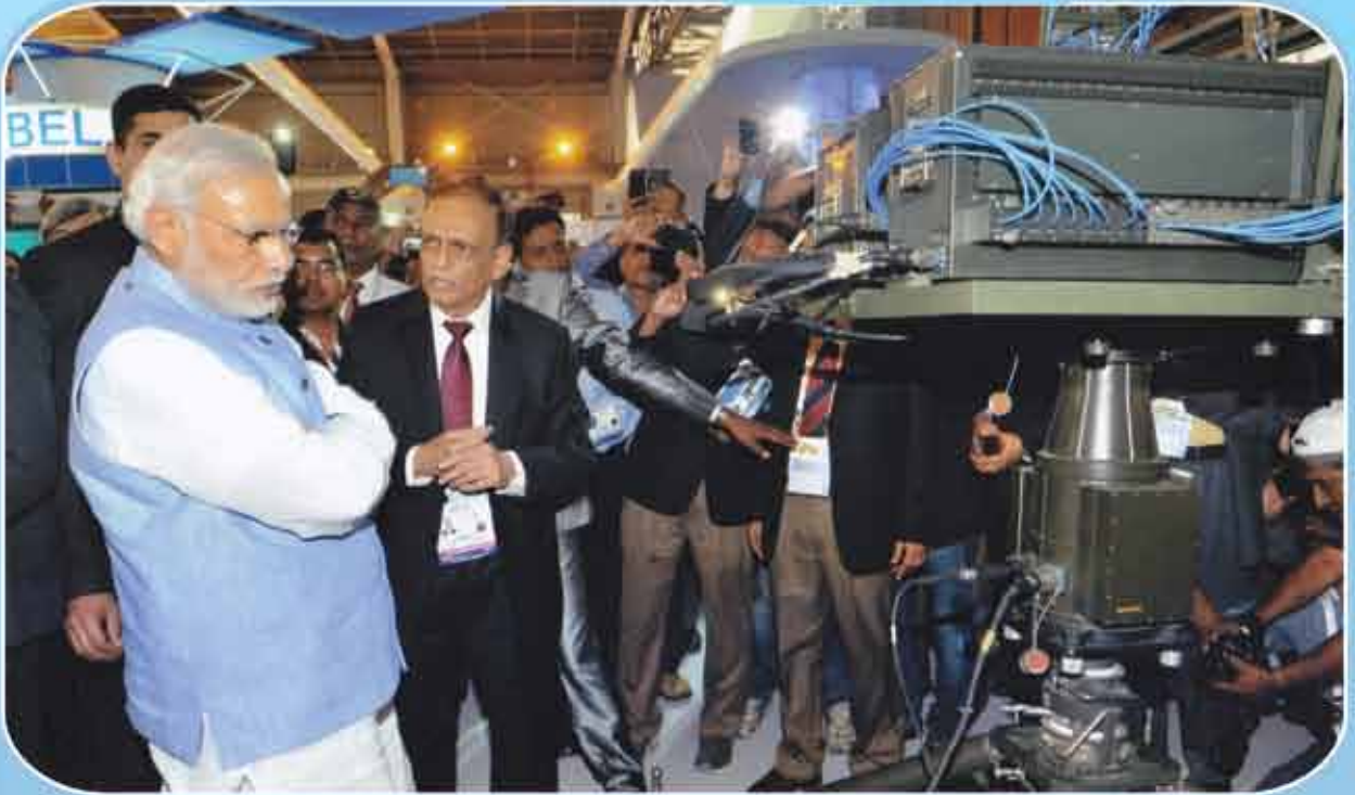
The Hon'ble Prime Minister, Shri Narendra Modi, being briefed by Mr S K Sharma, CMD, at the BEL stall during Aero India 2015.