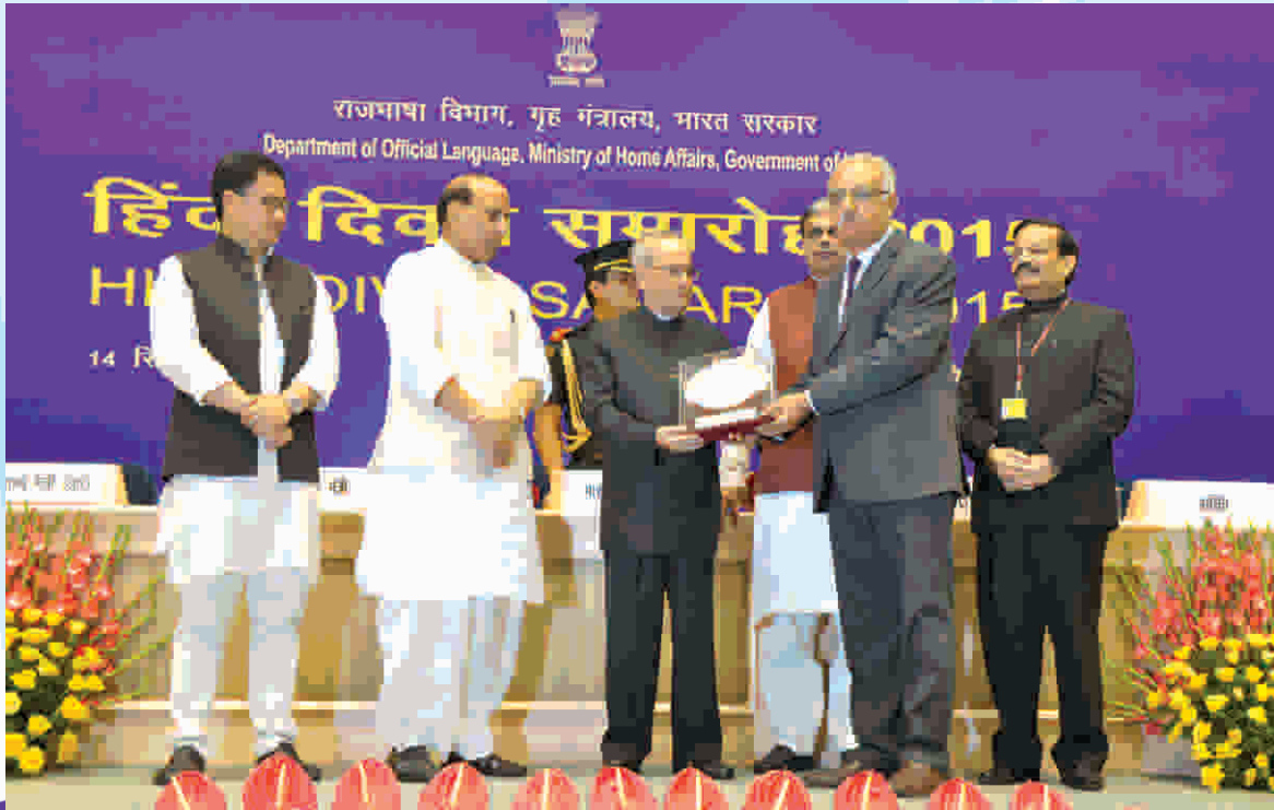
'Rajbhasha Kirti' national award for 'Surabhi', the Hindi house magazine of BEL's Bangalore Complex