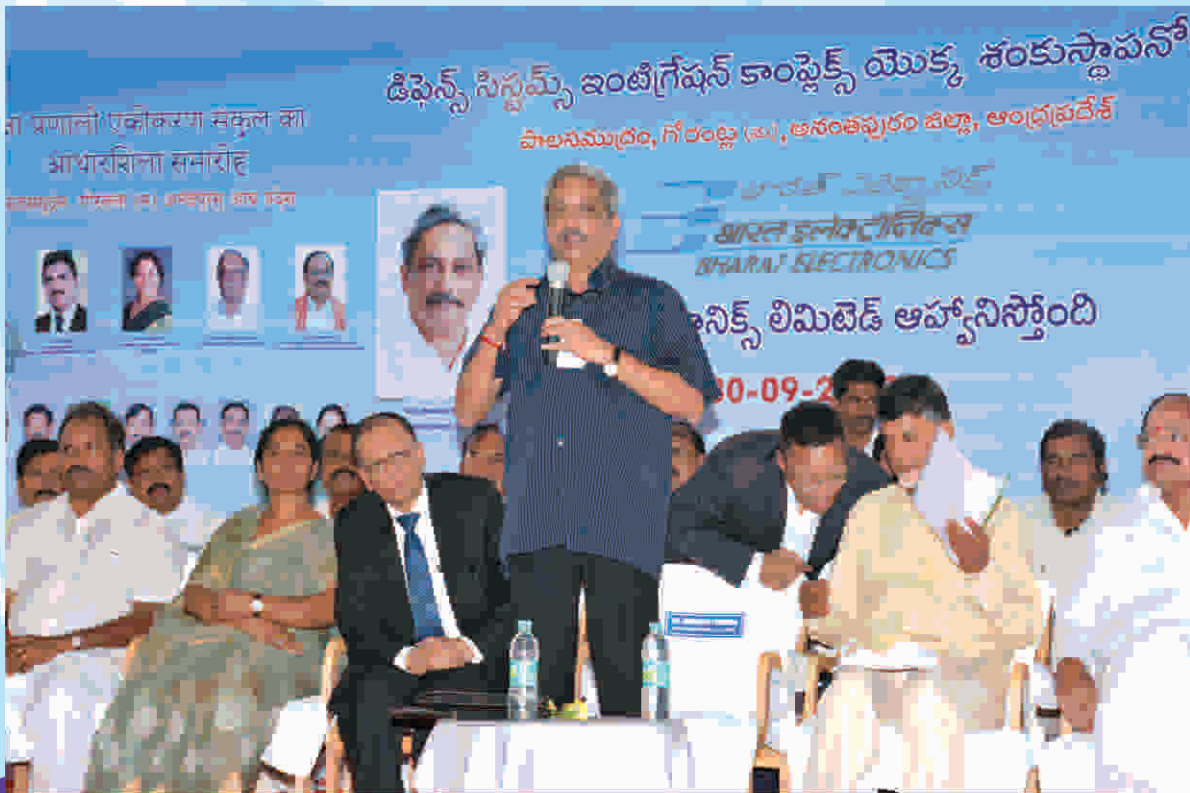
Foundation stone laying ceremony of Defence Systems Integration Complex at Palasamudram, Andhra Pradesh