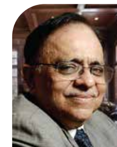
Shri Vikram Swarup