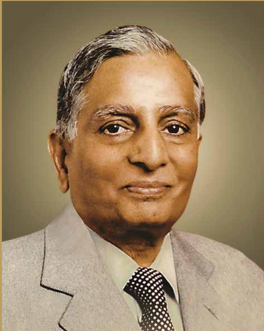
Madhav Prasadji Birla (1918-1990)