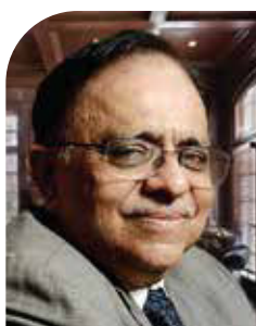
Shri Vikram Swarup