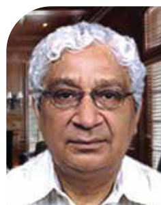
Dr. Deepak Nayyar