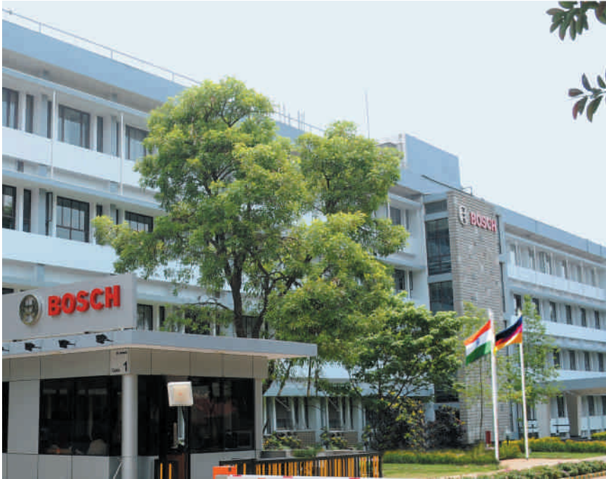
Bosch Limited Corporate Office in Bangalore, India.

Bosch has been present in India for more than 80 years - first through a representative office in Calcutta since 1922, and from 1951 through its subsidiary Bosch Limited.