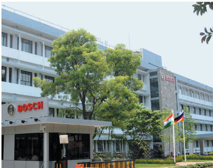
Bosch Limited Corporate Office in Bangalore, India.

Bosch has been present in India for more than 80 years - first through a representative office in Calcutta since 1922, and from 1951 through its subsidiary Bosch Limited.