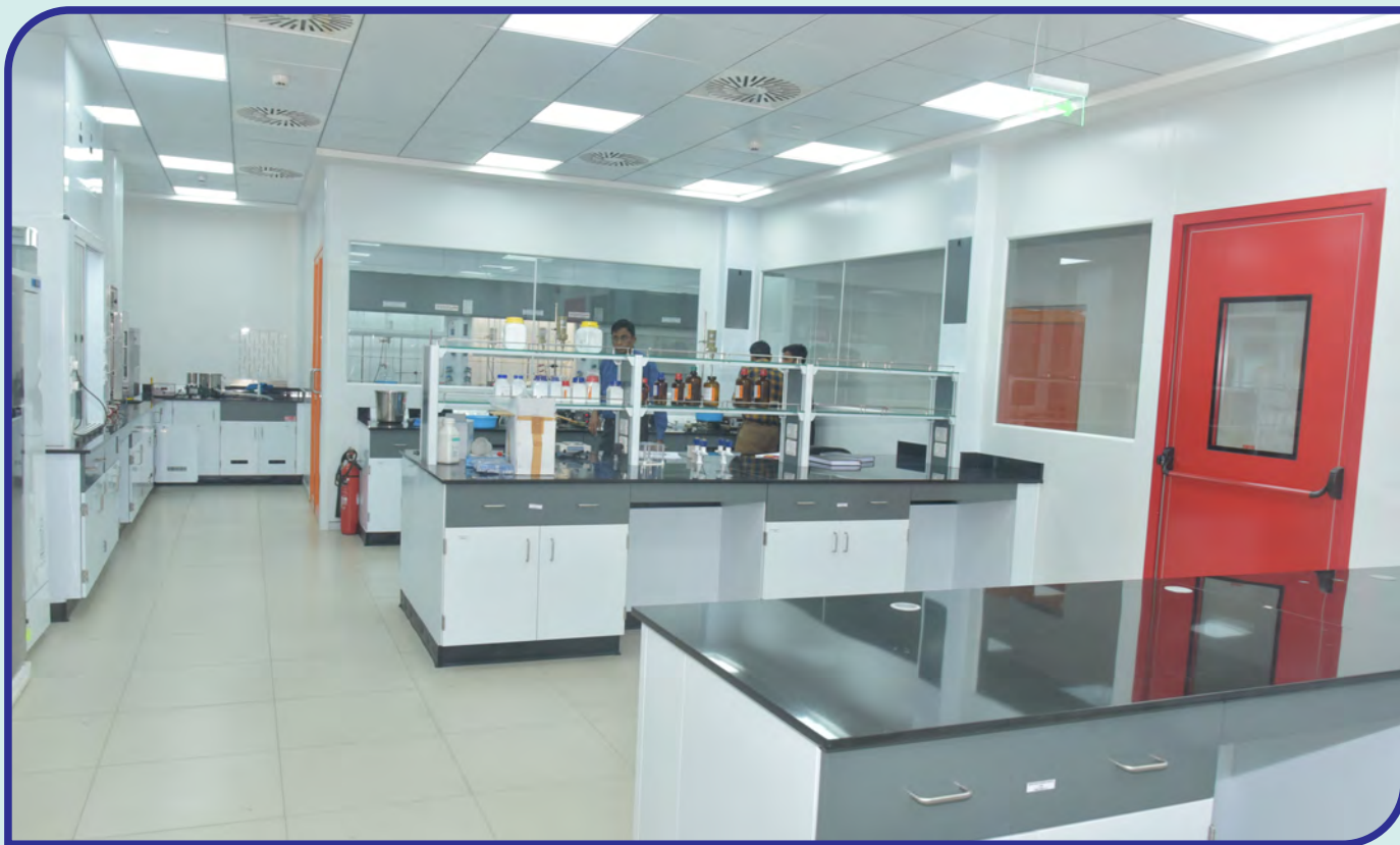
New Research & Development Lab