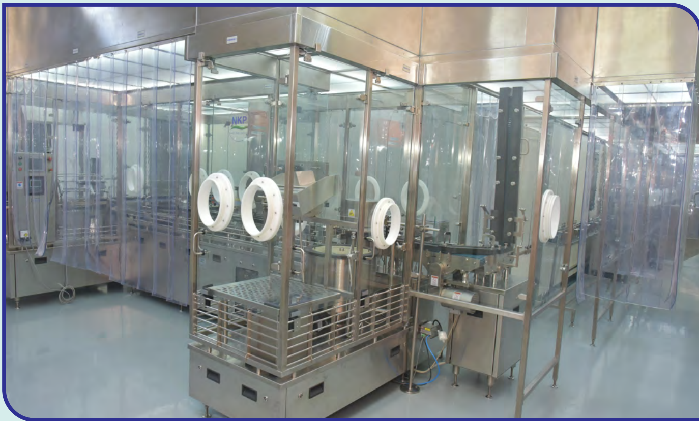
Ertapenem Line (Filling Section)