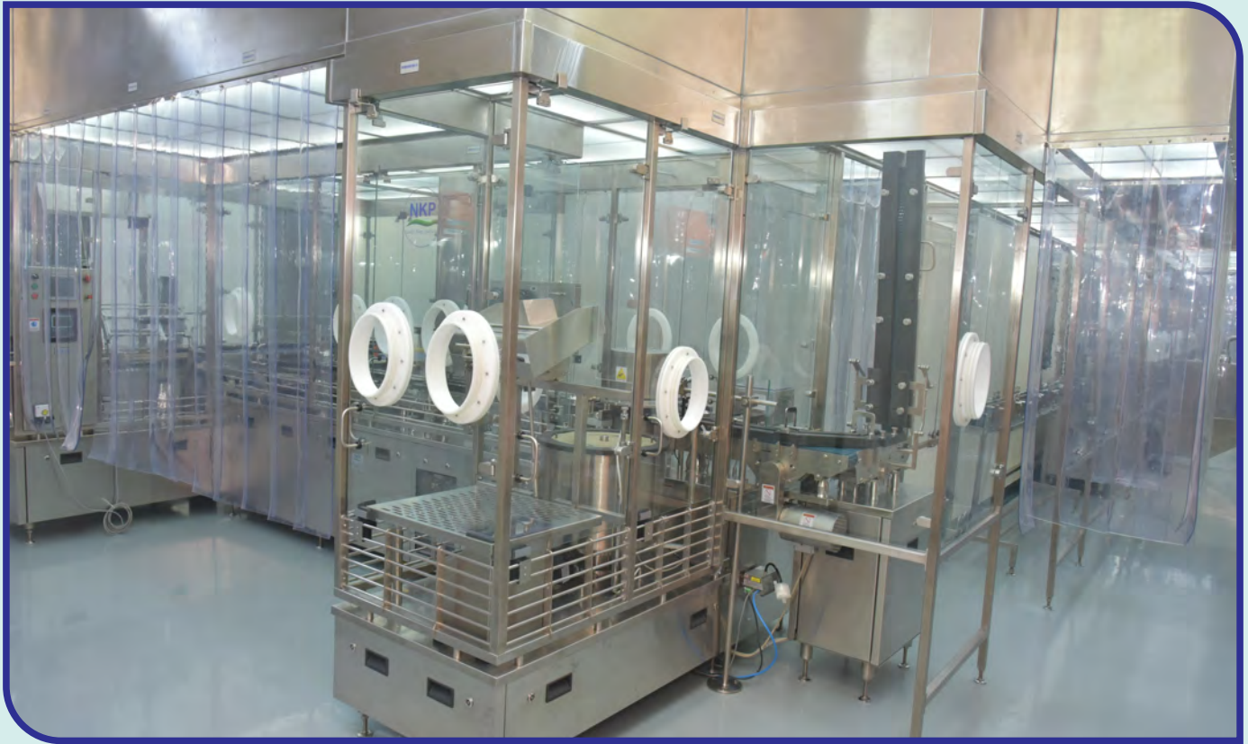
Ertapenem Line (Filling Section)