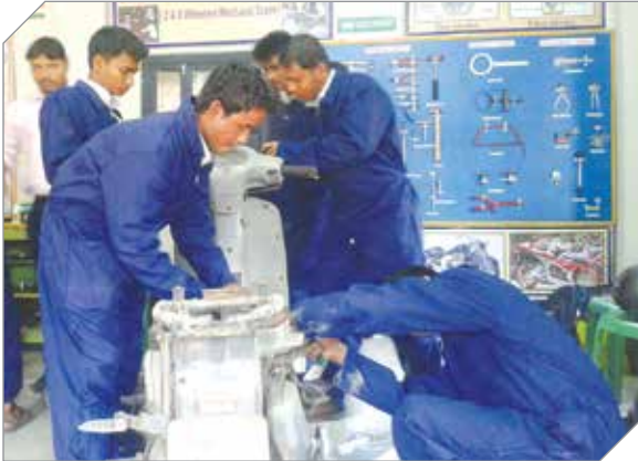
✓ Local technicians getting practical training on two-wheeler servicing under Castrol's Eklavya programme ( Aimed at strengthening of skills development in the automotive and industrial sectors, with a focus on technology )