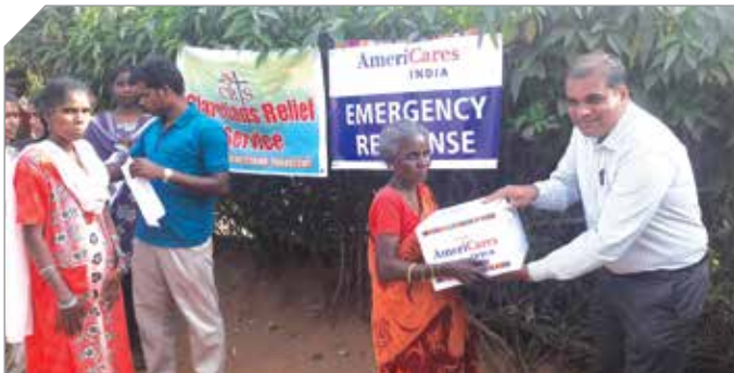
✓ Distribution of medical and basic health care kits in a flood-affected village near Chennai under Castrol's Ehsaas programme ( Humanitarian aid )