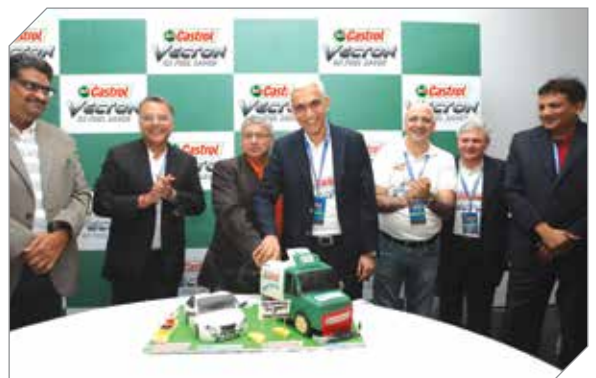
✓ Castrol India and Tata Motors teams celebrating 30 years of a winning partnership