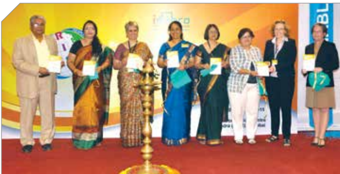
✓ Round table session to understand road safety issues in association with AmeriCares India Foundation under Castrol's Ehtiyat programme ( Collaborating for safer mobility )