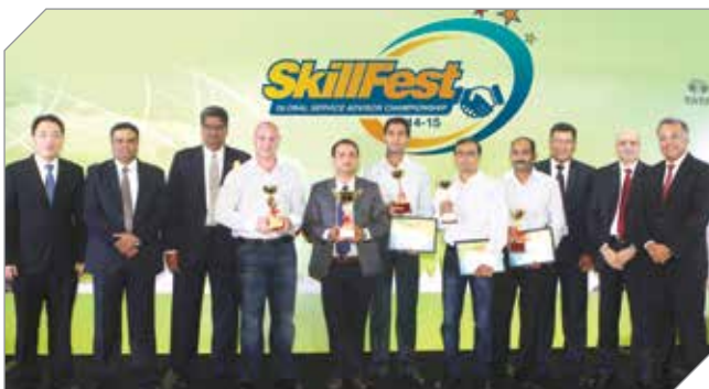
✓ SkillFest - a skill development programme run jointly by Tata Motors and Castrol India, went global last year with participants from 28 countries