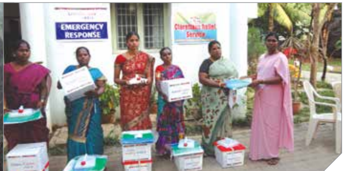
✓ Distribution of medical and basic health care kits in a flood-affected village near Chennai under Castrol's Ehsaas programme ( Humanitarian aid )