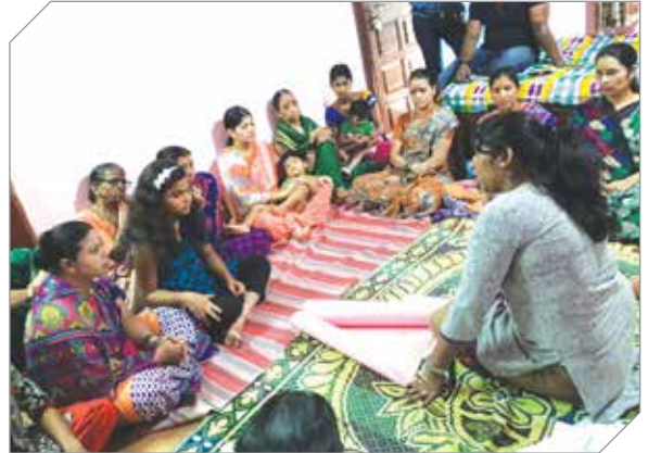
✓ Group discussion with local women in Silvassa to understand community needs under Castrol's Ekjut programme ( Community development )