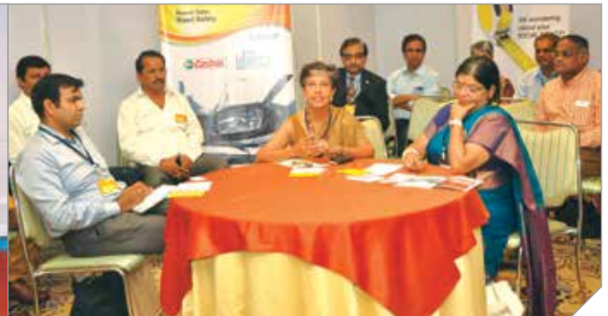
✓ Round table session to understand road safety issues in association with AmeriCares India Foundation under Castrol's Ehtiyat programme ( Collaborating for safer mobility )