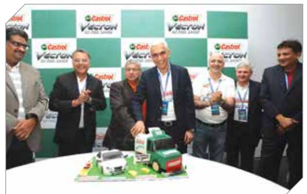
✓ Castrol India and Tata Motors teams celebrating 30 years of a winning partnership