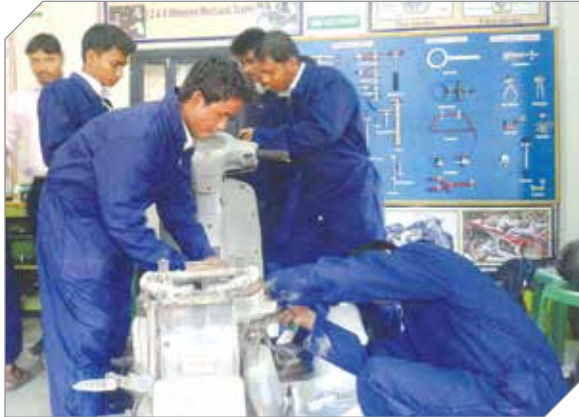
✓ Local technicians getting practical training on two-wheeler servicing under Castrol's Eklavya programme ( Aimed at strengthening of skills development in the automotive and industrial sectors, with a focus on technology )