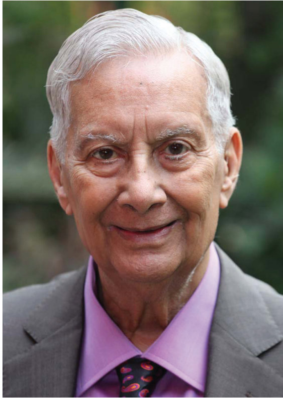
Mr. B.K. Birla - Chairman