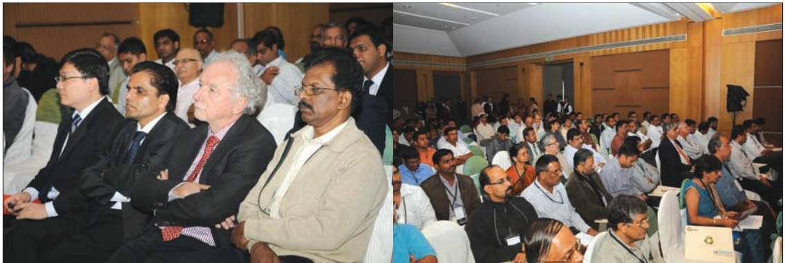
Delegates at the E-Waste Recycling Conference in Bengaluru