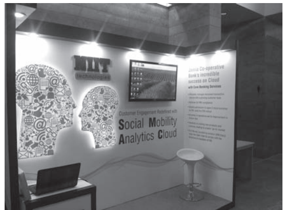
NIIT Technologies' booth at the NASSCOM Leadership Forum 2014

The NASSCOM India Leadership Forum (NILF) 2014 held in February brought together over 1,000 companies, more than 1,500 delegates from 31 countries and a battery of reputed speakers, who addressed wide-ranging topics. The conclave's theme this year was 'Crafting the Digital Enterprise'. NIIT Technologies used this forum to announce its approach to offer Digital Services.