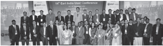
The Esri India team at the event

Esri India's (a joint venture between NIIT Technologies Limited, and Esri Inc.) 14th User Conference 2013 was themed 'GIS Transforming our World'. The platform brought together the GIS community to share experiences, best practices, applications, and success stories. The Esri India User Conference raised awareness about the wide range of GIS solutions that were available with Esri India, its business partners and other exhibitors. The three-day technology extravaganza was held from December 10-12, 2013 in Delhi, drawing 800 delegates from more than 70 organisations.