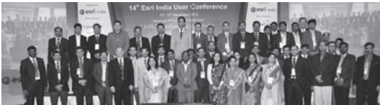
The Esri India team at the event

Esri India's (a joint venture between NIIT Technologies Limited, and Esri Inc.) 14th User Conference 2013 was themed 'GIS Transforming our World'. The platform brought together the GIS community to share experiences, best practices, applications, and success stories. The Esri India User Conference raised awareness about the wide range of GIS solutions that were available with Esri India, its business partners and other exhibitors. The three-day technology extravaganza was held from December 10-12, 2013 in Delhi, drawing 800 delegates from more than 70 organisations.