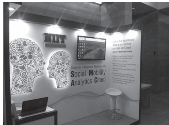
NIIT Technologies' booth at the NASSCOM Leadership Forum 2014

The NASSCOM India Leadership Forum (NILF) 2014 held in February brought together over 1,000 companies, more than 1,500 delegates from 31 countries and a battery of reputed speakers, who addressed wide-ranging topics. The conclave's theme this year was 'Crafting the Digital Enterprise'. NIIT Technologies used this forum to announce its approach to offer Digital Services.