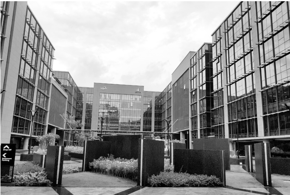
Sattva Knowledge Court Commercial Building for M/s Darshita Hi-Rise Pvt Ltd at Bengaluru, Karnataka.