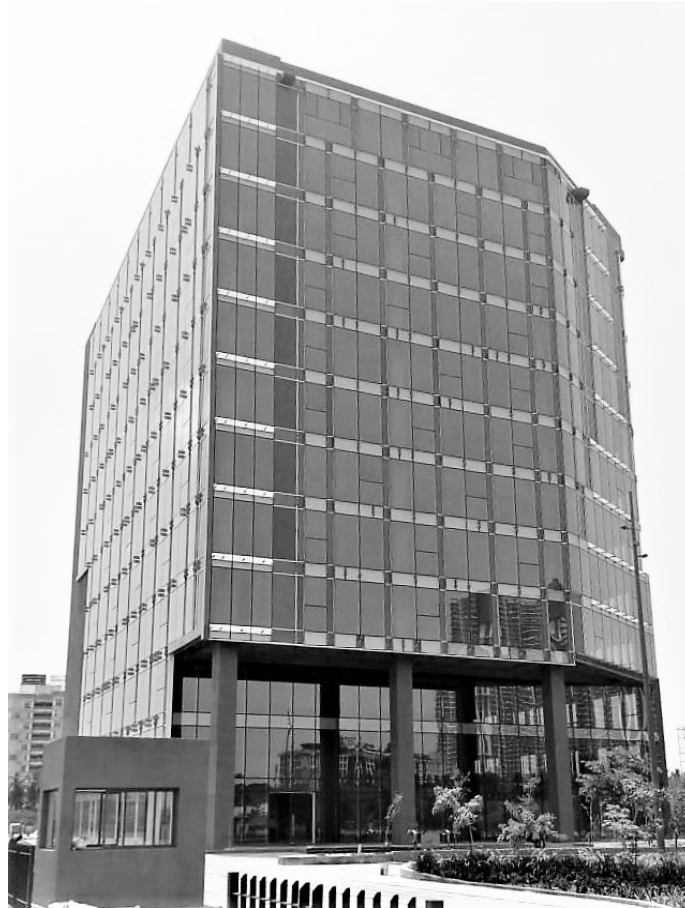
South West Multi-use Retail (SWMR) -Commercial Building for M/s Karle Infra Pvt Ltd at Bengaluru, Karnataka.

► CREATIVE ► COMMITTED ► CUSTOMER FOCUSED