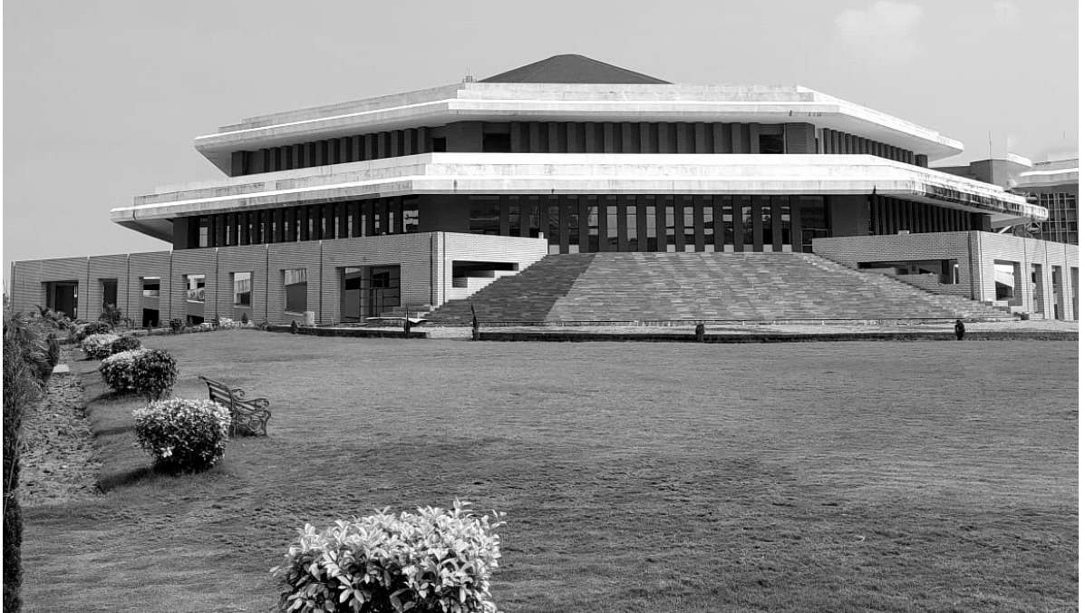
Auditorium / Lecture Hall Building for M/s Xavier University at Bhubaneswar, Odisha