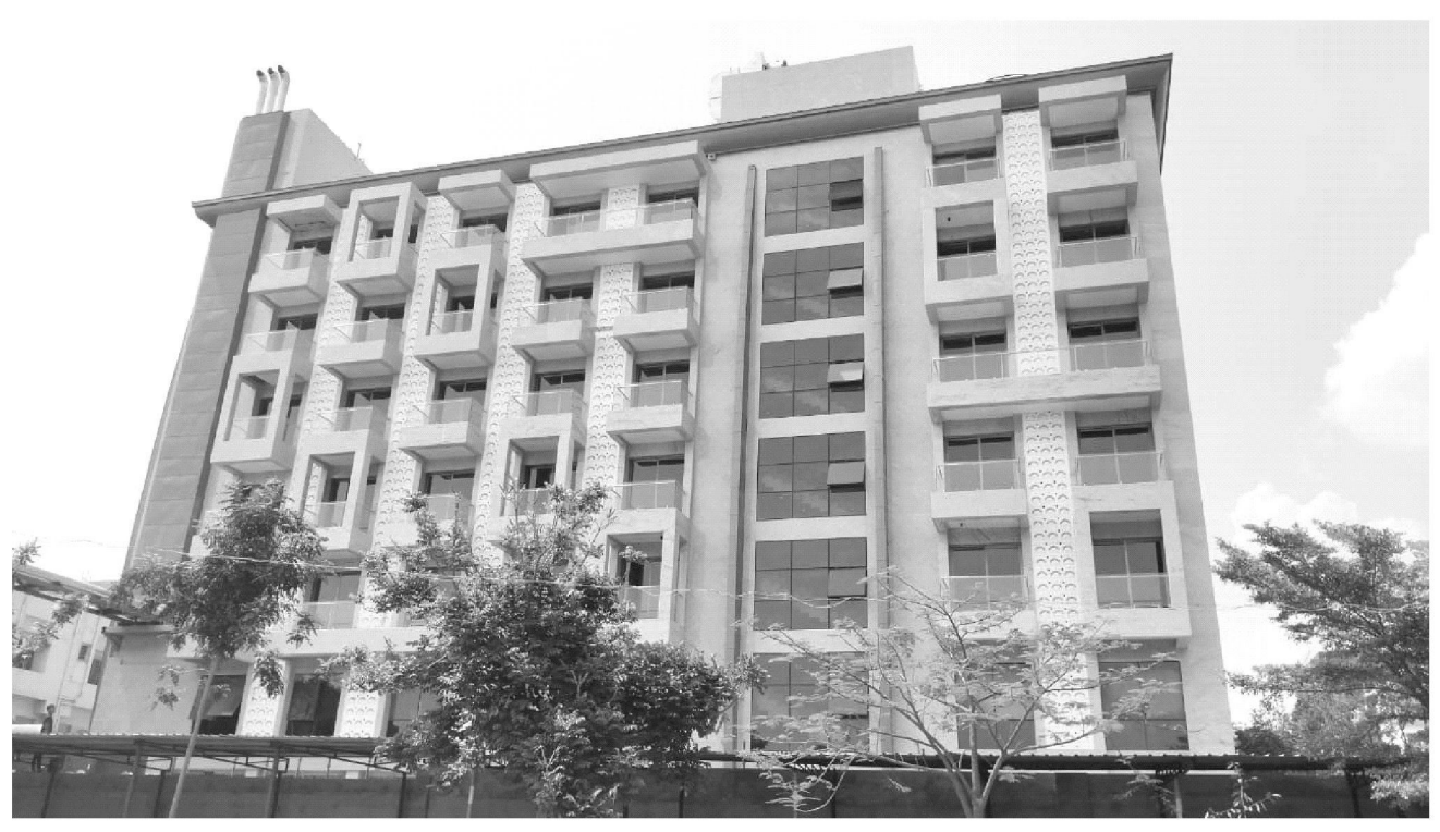
Institutional Building for M/s C.I.S.C.E -Council for the Indian School Certificate Examination (Regional Institute) at Habsiguda, Hyderabad