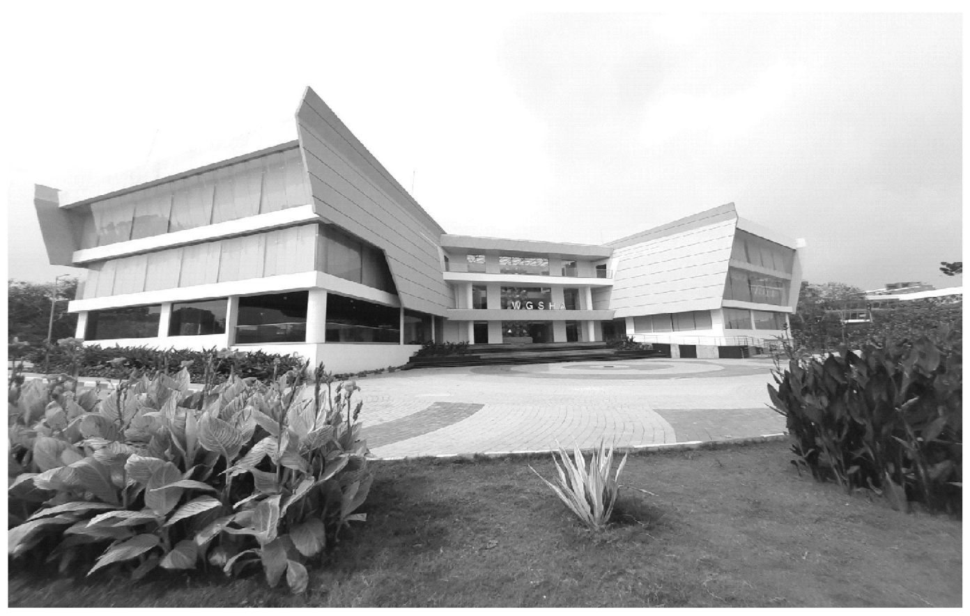
(Welcome Group School of Hotel Administration – WGSHA) Academic block building for M/s Manipal Academy of Higher Education at Manipal, Karnataka.

▶ CREATIVE ▶ COMMITTED ▶ CUSTOMER FOCUSED