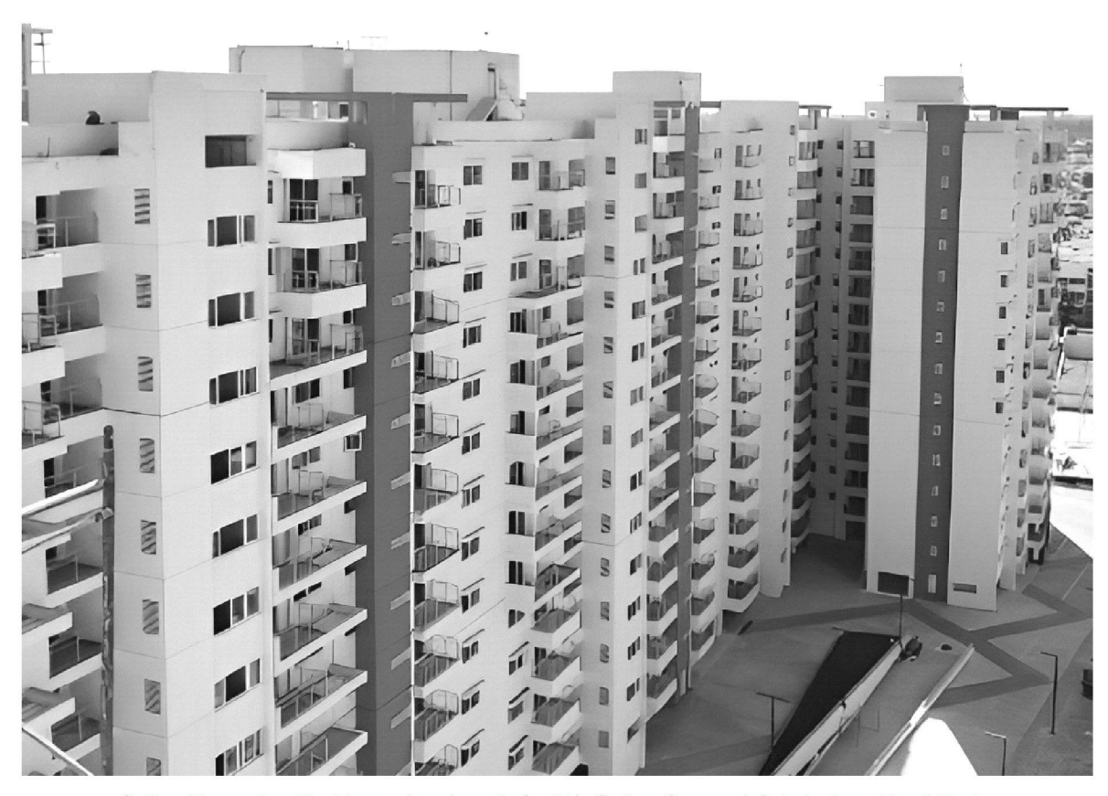
Sattva Navaratna Residency Apartments for M/s Sattva Group at Coimbatore, Tamil Nadu.