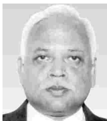
Director (Intl. Marketing & Operations)