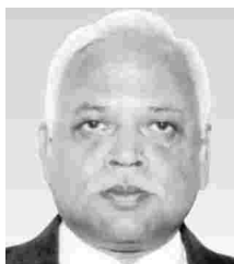
Director (Intl. Marketing & Operations)