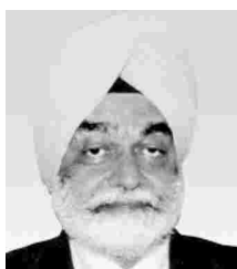
Director (Projects & Services)