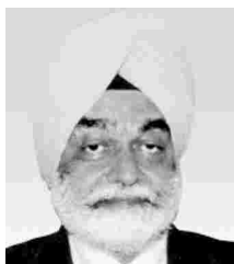
Director (Projects & Services)