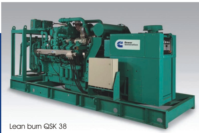
Lean burn QSK 38

Within each of these two business units, we have a number of “performance cells” which are diverse, cross-functional teams that work together seamlessly towards common objectives. Their performance is measured on clearly identified quantitative and qualitative targets which they own. All employees in the company have a significant component of their compensation tied to individual and