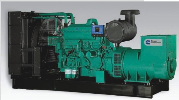
K 19 - 500 kVa

one engines manufactured in India. They are very rugged in construction and practically trouble free compared to the other engines we have. The original spares are easily available. Best technical support by your staff and great support by your dealer M/s Ajax Engineering from Bangalore. In fact last year we added about 11 DG of 250 kVA all Cummins at my recommendation to our MD. I wish you and all your staff good luck.