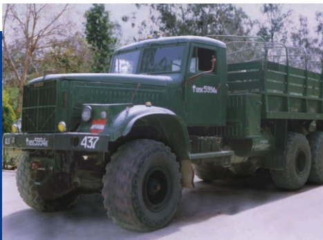
Kraz 255 Defence Truck repowered by Cummins NT-743-C

Coast Guard projects. As the water well rig segment went into a cyclical recession, we partnered with one of our major strategic OEM to provide customers with a lower cost reconditioned engine-compressor package which was well received. We are working closely with the Indian