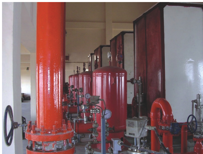
Firepump Installation powered by Cummins V28 engines

Cummins managers about their experiences (both good and bad) with us, and suggestions on how we can further improve. This program is now in its fourth year.