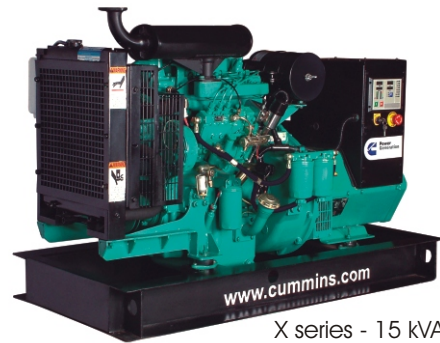
X series - 15 kVA

I will quote from one of our customers, among many, who was kind enough to send us an email on our website www.cumminsindia.com : "Congratulations on your product. We have in our fleet more than 100 DG sets of capacities varying from 15 kVA to 380 kVA.