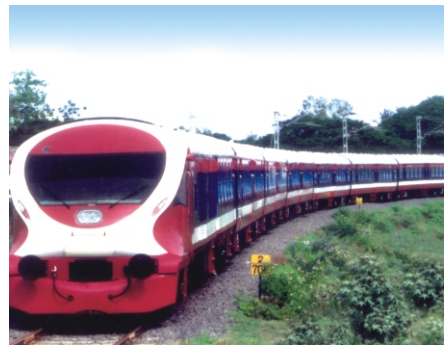
HHPDEMU (High Horse Power Diesel Electric Multiple Unit) with new aerodynamic design powered by Cummins KTA-50-L