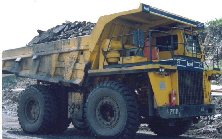
50T mining dump truck powered by Cummins KTA-19-C

C reating Wealth For All Stakeholders : The company's sales grew by 28 percent to Rs. 11,918 million, and profit after tax grew by 26 percent to 1,372 million. Significant inflation in core commodities such as steel, copper and fuel oils adversely impacted our results. However, by