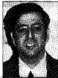
पुणे केंदूर दुर्गा रहिवार मोडिफिक

duplexes complete family rooms and quarters.