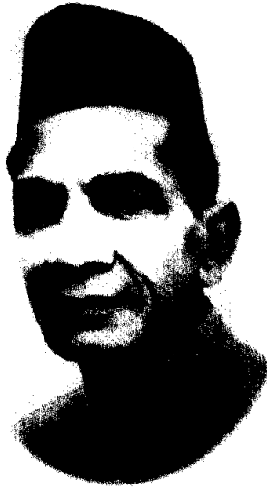
LALA SHRI RAM (1884-1963)