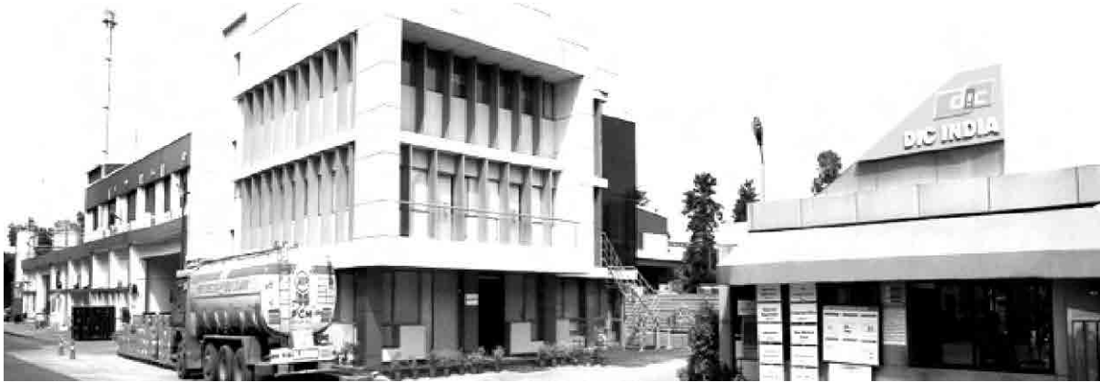
Noida Plant –Manufacturing facility for Liquid inks, News Inks Color and Flexo

DIC India has strategically established manufacturing locations throughout the Country to provide the most effective service to customers.