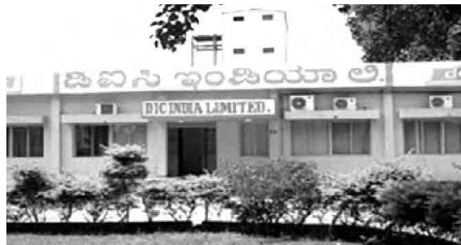
Ahmedabad Plant – Manufacturing facility for News Black